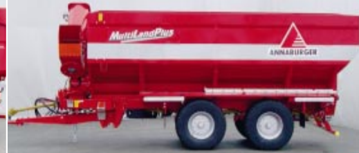
Chaser bin / reloading module

For rape, grain and all other combinable crops