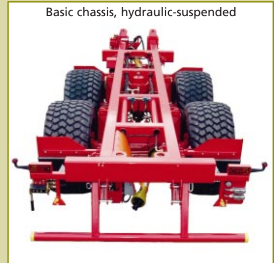
Basic chassis, hydraulic-suspended

Test in practice and be convinced by the advantages of the MULTILAND PLUS!