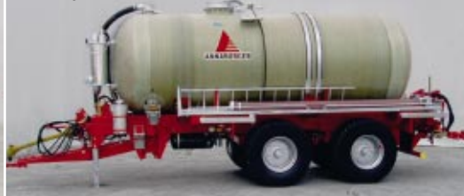
Slurry tank module

For the transportation and spreading of liquid manure and fertilizer