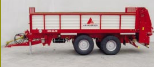
Universal manure spreader module

For spreading farmyard and chicken manure, compost and lime