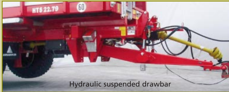
Hydraulic suspended drawbar